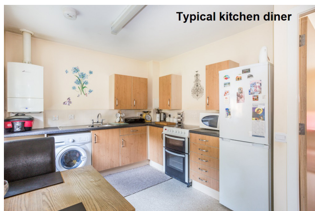
Typical kitchen diner

The amenity properties are fitted with a community alarm system, which allows residents to summon help in an emergency.