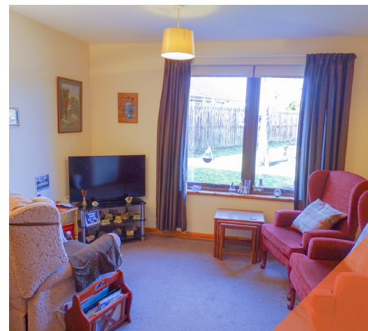
Resident flats pictured showing similar property style