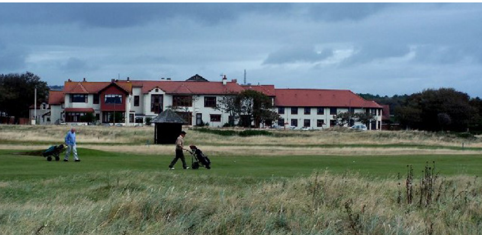
Royal Troon Golf Course

To find out more about Buchan Road - or to apply for a property - call 0141 553 6300 or email westinfo@hanover.scot