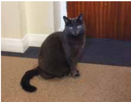
Honorary dog Thea took charge at Cairndow Court in Glasgow .