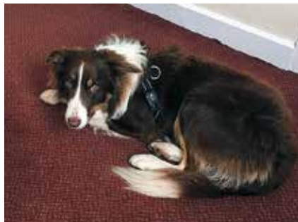
Hanover Court in Dunblane had this gorgeous visitor!