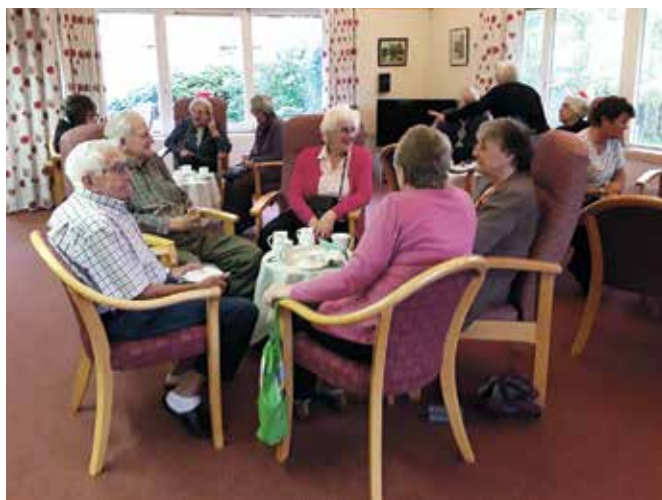
At Whyte Court in Kinross , residents raised £300 for the cause.

Once again, Hanover residents and staff have risen to the occasion and astounded us with their fundraising successes. The World's Biggest Coffee Morning is the MacMillan cancer charity's biggest fundraising event and Hanover developments and offices across Scotland took part.