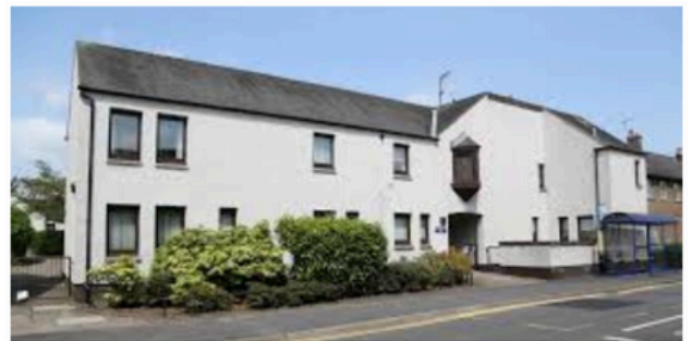
Sir John Graham Court

Interested? Contact us today by: Email: eastinfo@hanover.scot Tel: 0800 111 4646